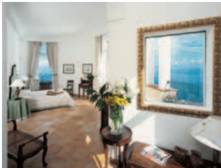
One of our special suites