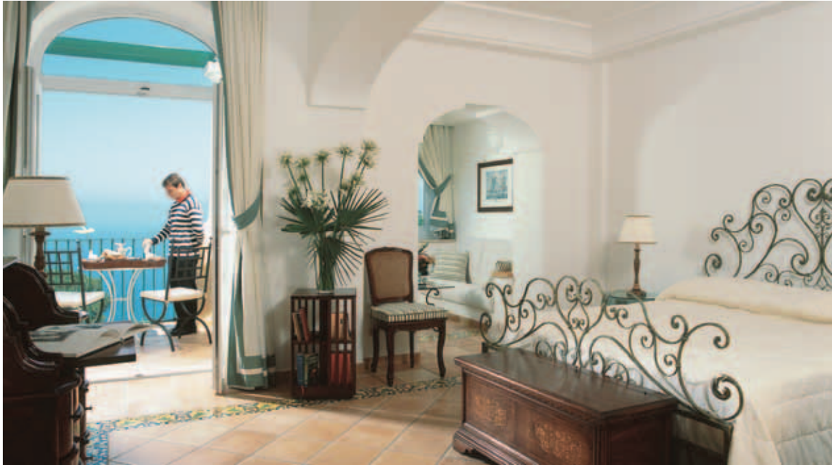
A junior suite overlooking paradise