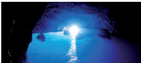
One of the seven wonders of the world, The Blue Grotta

TERRACE OF LUCULLUS IS THE ENCHANTING CLIFF TOP RESTAURANT CLOSE TO THE SWIMMING POOL WITH UNSURPASSED VIEWS OF THE BAY OF NAPLES . AT THE TERRACE DISHES ARE PREPARED WITH A PASSIONATE COMMITMENT TO CAPRI'S GASTRONOMY TRADITIONS AND TYPICAL FLAVOURS. GUESTS CAN RELAX AND ENJOY THE GREAT PANAROMAS FROM THE LARGE TERRACE AND LOUNGE THAT AFFORDS MEMORABLE VIEWS ACROSS THE WATERS SURROUNDING THE ISLAND OF CAPRI WHICH STRETCHES FROM ISCHIA TO SORRENTO.